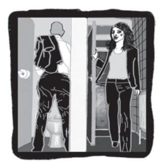
from Peeing in Peace

People who do not identify as either male or female, or who do not appear obviously male or female, face continual difficulty in having to decide which restroom to use. Providing gender-neutral restrooms is very important. If you feel this is a problem, ask yourself why it is important to your organization to have separate male and female restrooms or whether you can establish gender-neutral restrooms. In addition to helping transgender people, providing gender-neutral restrooms will also make your space more accessible to people who might need assistance in the restroom from someone of the opposite sex, such as parents with young children and people with some disabilities or seniors with caregivers.