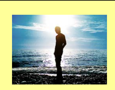
I am not FTM or MTF. I'm Genderqueer and have receptive penetrative sex with men.

United States Census Bureau, 2008). In 2008, CDC estimated that approximately 56,300 people were newly infected with HIV in 2006 (the most recent year that data are available), and that there has been no significant decline among the yearly incidence of new infections in the last decade (CDC, 2008). One of the fastest growing populations to be infected with HIV are transgender people. In California, publicly-funded counseling and testing sites reported that transgender women have higher rates of HIV diagnosis (6%) than all other risk categories, including MSM (4%) and partners of people living with HIV (5%), and African American transgender women have a substantially higher rate of HIV diagnosis (29%) than all other racial or ethnic groups (California Department of Health Services, 2006).