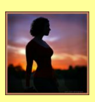
I'm a female, only my body is a little different and I can penetrate my boyfriends and ejaculate semen.